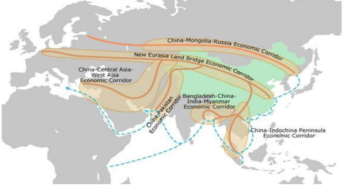
Figure 2: The most important economic corridors used by the New Silk Road

Literature also shows that the exact routes of the New Silk Road Initiative have not yet been fully defined, but will consist of several land and sea transport routes that will stimulate trade and economic development (FALLON, 2015). The mainland Silk Road is mainly directed to Central Asia and Europe, while the Maritime Silk Road mainly covers the countries of Southeast, South and North Asia (YU, 2017). The conception is focusing on six economic corridors ( Figure 2 ) (CASARINI, 2016; FUNG ET AL., 2018).