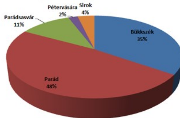
Figure 1. The distribution of of commercial accommodation places in 2013

The development of the places of the commercial accommodation has undergone significant changes, fluctuations are well visible in the figure. In my opinion, however, the list is incomplete, as only the following settlements could be made in the database: Bükkszék, Parád, Parádsasvár, Pétervására, Recsk, Sirok.