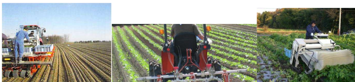
Figure 1. Some agrotechnical elements of angelica production (Hitachinaka, Japan)

Some agrotechnical elements are shown in Figure 1 .