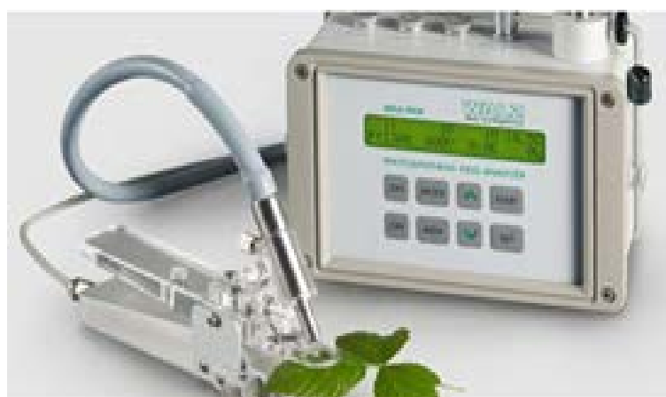
Figure 2. MINI-PAM fluorometer

Statistical analysis was carried out with the SPSS statistical computer package (SPSS for Windows, Version Release 11,5). Statistically differences in F_o/F_m were analyzed by GLM procedure and factor level was established according to factor significance and interactions. Studies of instantaneous comparisons were carried out by analysis of variance (ANOVA). Significant effect of means was identified with Tukey-test at 0.05 probabilities.