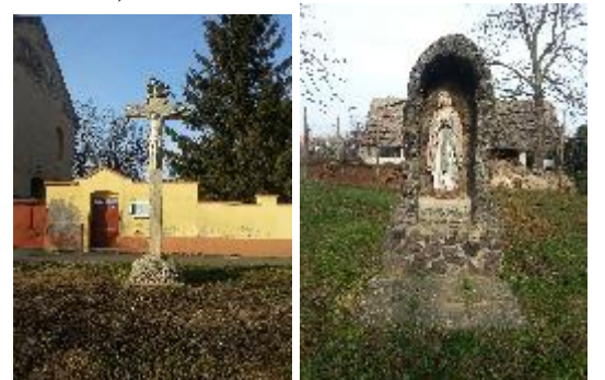
Figure 4. The Crucifixion and Mater Dolorosa

" The Crucifixion" (Figure 4) is a rondo-bosso sculpture erected in 1802 in Periam, by the roadside. The author is anonymous and the monument is made of grit stone. The body of Jesus tormented by the pain is lifeless and the physiognomy is schematised; above it, the figure of the Celestial Father overlooks the episode (bearing a globe in His left hand and the dove of the Holy Ghost in His right hand); at the foot of the crucifix lies the nature-size statue of Mater Dolorosa . The artisanal way in which the statue was made suggest the training level of the master left anonymous. The conservation status is mediocre: the statue must have undergone successive, undocumented remakes.