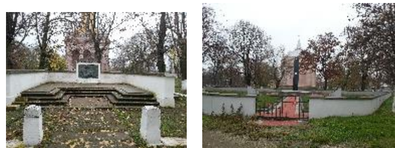
Figure 3. Monument of the Heroes of World War II and monument of the Anonymous Soldier

<u>Monuments erected in the honour of heroes</u>. A first monument, dedicated to the memory of the heroes of World War I, is located in the Cemetery of Periam. It was built in 1927 with money collected by the inhabitants. At present, there is not much to see and admire of it because it has been seriously damaged. A second monument (Figure 3) , dedicated to the heroes of World War II, is located in the park, in front of the Haulik Church. It is a square piece of marble with the names of the heroes on it; on the front side of the monument, there is a bas-relief representing a wounded soldier. The third monument is dedicated to the anonymous soldier. It is located opposite the Haulik Church, in the park.