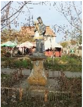
Figure 5. Statue of Saint John of Nepomuk

John of Nepomuk was a priest and martyr. He was born in 1350 as Johannes Welflin, near Nepomuk, and he died in 1393, in Prague. According to the legend, he got killed by the king because he did not want to break the rules and disclose the queen's confessions. The priest was sanctified only in 1729. There are statues of the priest along the routes – one of them is in Periam ( Figure 5 ).