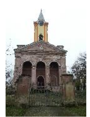
Figure 2. The "Haulik" Greek-Catholic Church

<u>Monuments erected in the honour of heroes</u>. A first monument, dedicated to the memory of the heroes of World War I, is located in the Cemetery of Periam. It was built in 1927 with money collected by the inhabitants. At present, there is not much to see and admire of it because it has been seriously damaged. A second monument (Figure 3) , dedicated to the heroes of World War II, is located in the park, in front of the Haulik Church. It is a square piece of marble with the names of the heroes on it; on the front side of the monument, there is a bas-relief representing a wounded soldier. The third monument is dedicated to the anonymous soldier. It is located opposite the Haulik Church, in the park.