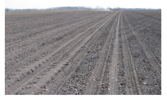
Figure 2. Plough technology soil preparation

The seedbed was suitable for sowing, porous, crumbled consistency, however there was a lack of precipitation in the period before sowing. It could be due to the low level of humidity in the soil or sometimes the uneven soil that the seed did not always get into wet soil.