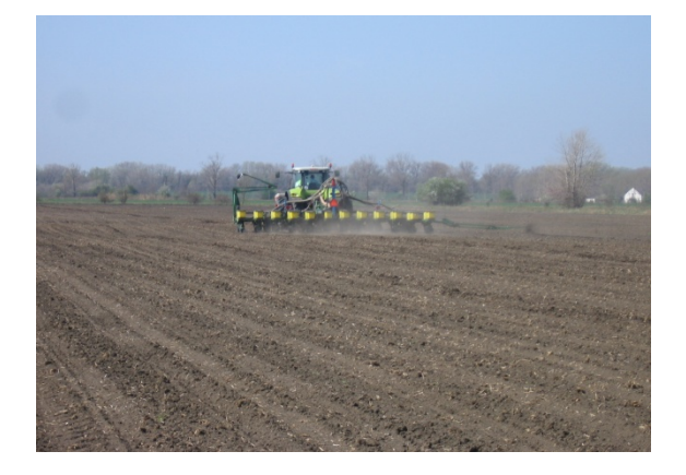
Figure 1. Ripping technology soil preparation

The research was carried out in the fields of Hód-Mezőgazda Zrt, Hódmezővásárhely, where the sowing took place in seed beds prepared for sowing in two different ways. One of the fields was prepared with the traditional technology (disking, ploughing, seedbed preparation) ( Figure 2. ), while the other field was prepared without turning the soil (ripping technology, disking, seedbed preparation) ( Figure 1. ) for preparing maize sowing.