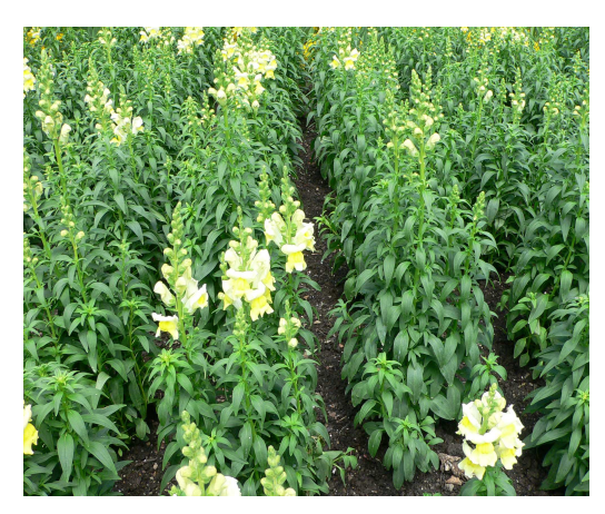
Figure 1. Experimental field of plants types in the study ( Tagetes erecta and Antirrhinum majus ) cultivars