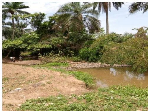
Figure 2: Pollution of River Water Through Eutrophication