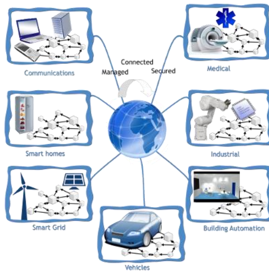
Figure 1. Internet of things paradigm

In general, the term Internet of Things (internet stuff) was coined by British entrepreneur Kevin Ashton 1999. It is a network of facilities (electronics, software, sensors) that allows data collection and processing [15] [17]. This allows objects to be controlled over the existing network infrastructure. Objects can be, for example, cardiac implants, car-built sensors, smart home appliances, etc.